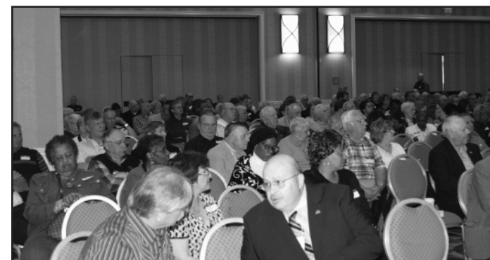
The 14th Annual Membership Meeting attracted over 350 Verizon retirees to Tarrytown, New York