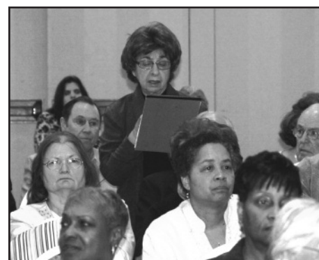
Many retirees participated in the Q&A portion of the meeting