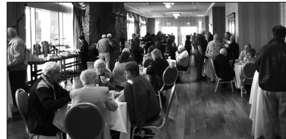
Association members had the opportunity to catch up with fellow Verizon retirees before the member meeting.

"In order to keep an employee for the entirety of his or her career, the company offered a compensation package that was more than just salary; it included a pension and retiree health-care. What if there were no Association to advocate for you and me, our surviving spouses and our benefits? I'd hate to think