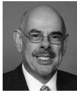
Henry A. Waxman

However, a week before the hearing Rep. Waxman abruptly canceled, stating that companies had asked for more time to assess the law as it is being implemented.